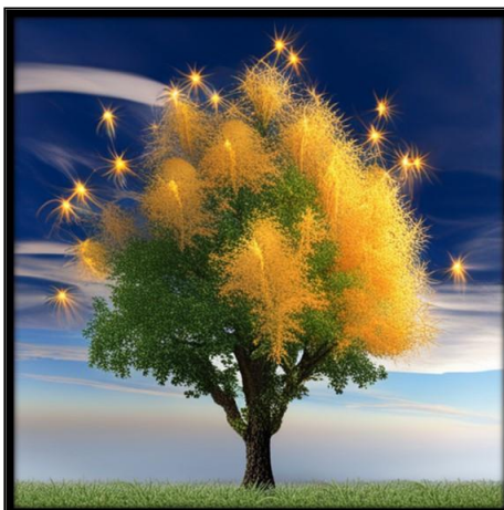
LEAP Schools (Mother tree)

For many of our LEAPSA's and supporters, the newly formed LEAP Institute is largely unknown. Our analogy is that of the LEAP schools being the mother tree with the LEAP Institute being a seedling now, aiming to develop communities (hubs) into full-fledged forests of abundance.